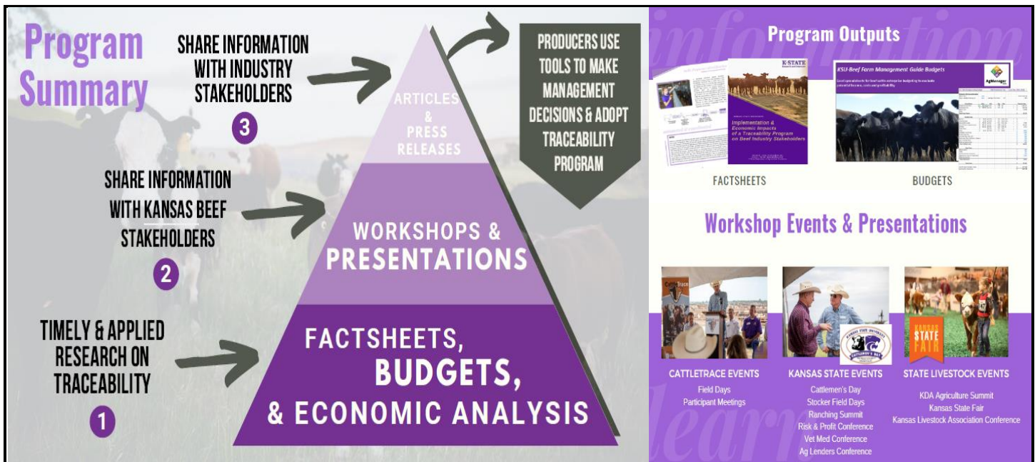
Figure 2. CattleTrace Extension Program Summary Diagram (Including program outputs, resources, and events)

Kansas State Stocker Field Days, and the Ranching Summit. 1,3